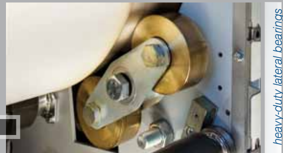
heavy-duty lateral bearings