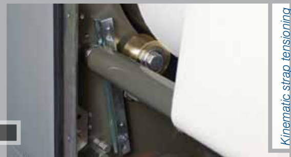
Kinematic strap tensioning