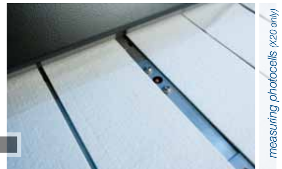
measuring photocells (x20 only)